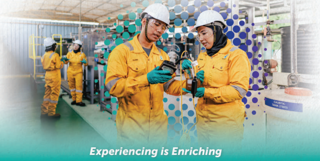
Experiencing is Enriching

Course for Certified Environmental Professional in the Operation of Industrial Effluent Treatment System (Biological Process)